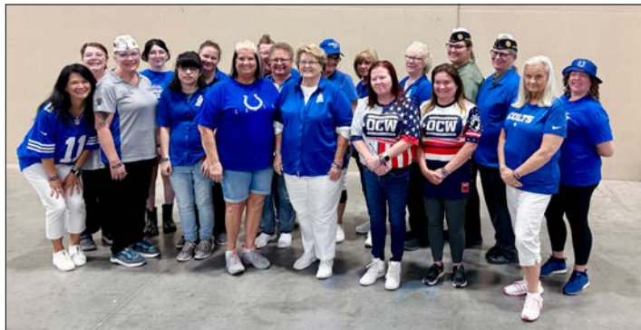
The Legion Family had the honor of presenting the flag at the Indianapolis Colt's game held August 11, 2024.