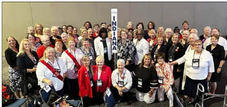
The Indiana Delegation at the National Convention held in New Orleans August 23-29, 2024.