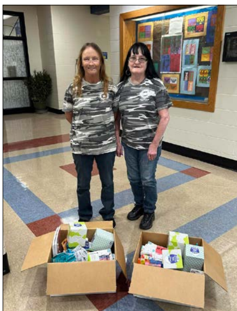
Thank you to Jasonville Unit 172 of the 7th District for providing school supplies to a Shakamak school.

Let's hear how you're ringing bells across the Department. If you have a photo or event you would like featured, please reach out to HANeditor@ameritech.net .