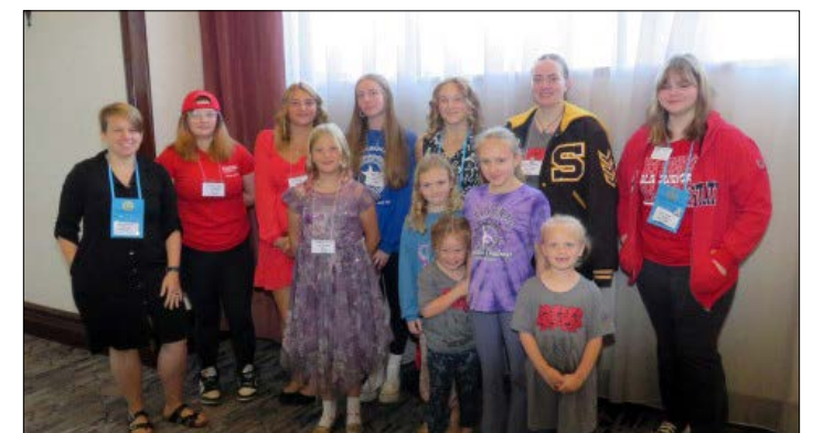
Department Juniors at this year's Fall Conference.