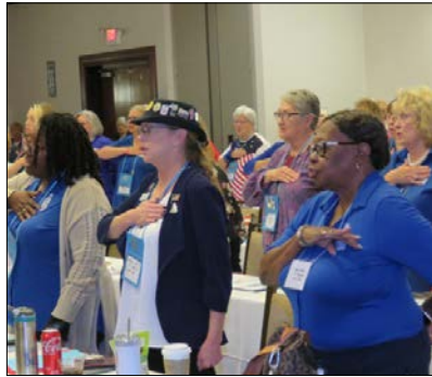
The Fall Conference held at the Marriott Hotel East was standing room only with attendees!

Indiana Veterans Home (IVH) located in West Lafayette, Indiana, offers long-term, skilled nursing care, short-term rehabilitation, independent living, and memory care to honorably discharged Indiana veterans and their spouses. Since 2018, they are accepting Gold Star parents. The Home provides many on-site services in a renovated, homelike settings. It also offers veteran-specific programs and events.