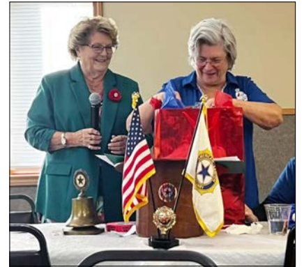
President Roxy has officially begun her Department Visitation!